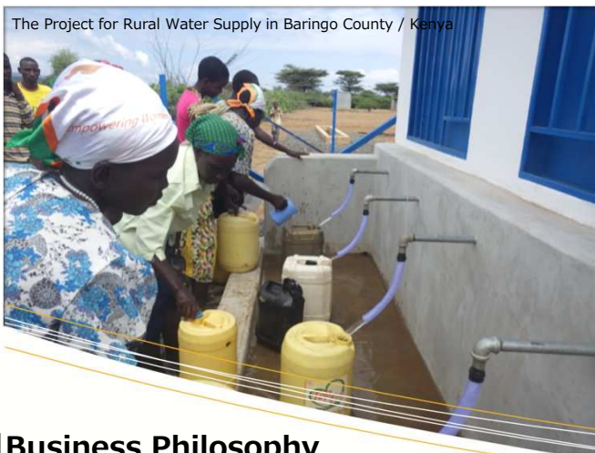
The Project for Rural Water Supply in Baringo County / Kenya