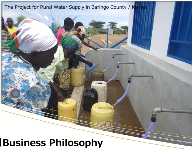
The Project for Rural Water Supply in Baringo County / Kenya